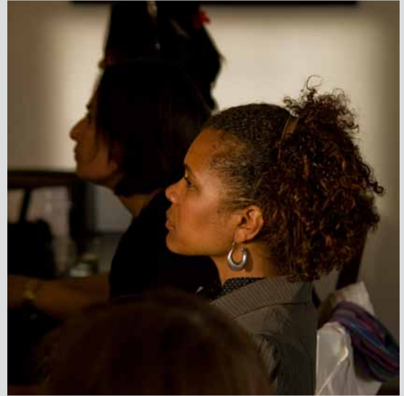
Photo: Guests at the 2010 Digital MashUp

The WIFT-T Short Film Showcase is an annual event that provides active members with an opportunity to submit their short films to be considered for our members' showcase. Join today and submit your short for a chance to win the Audience Choice Award!